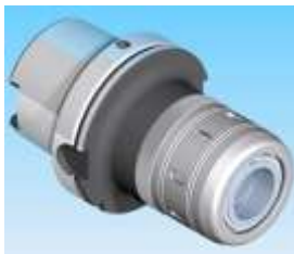
A) Great Power Collet Chuck

With the same holder system, we have available in the catalogue also products; Great Power Collet Chuck, Reducing Adapter to HSK, Blank toolholders, Modular System and a Test Arbor for control and measurement "in situ" of the spindle of the machining centers.