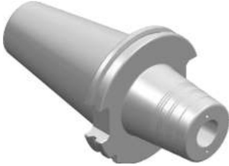
F) Double contact Din-69871 SK50 Shrink fit chuck

We go on with the special requires of our customers to avoid the machining problems where the measure and the taper model is a highly important point to take into account such as double contact Din 69871-SK50 (check picture F) or DIN 69871-SK60 (check picture G).