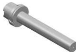
E) Test arbor