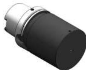
C) Blank toolholder