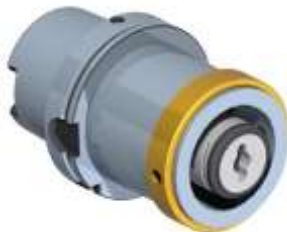
B) Adapter to HSK