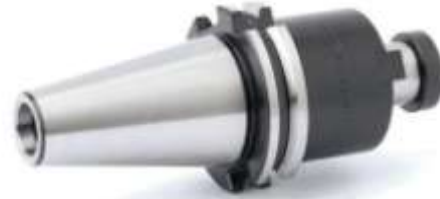
G) DIN-69871 SK60 Shell End Mill Arbor